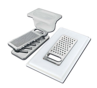
Graters kit with ring-holder and food collection tray