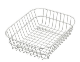
White basket 8612 100

* only in combination with the accessory 8100 627