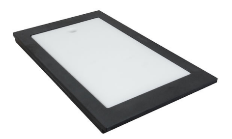
HDPE + Black Twin chopping board 8100 627

* only in combination with the accessory 8100 627