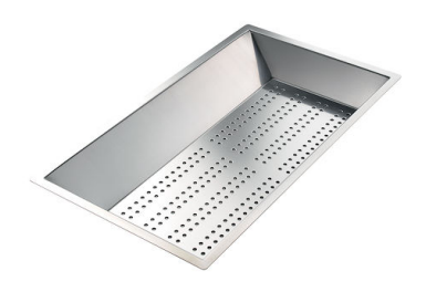
Stainless steel perforated tray